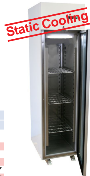
LabStar Sirius LSSI 3505GEWU